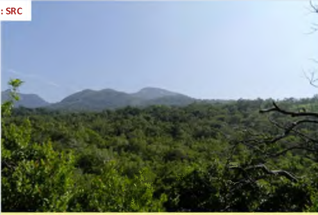
Southern Tropical Wet Evergreen forest at Singalteri in Kalakkad Mundathurai Tiger Reserve, Tamil Nadu