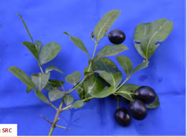
Carissa carandas (Apocynaceae)