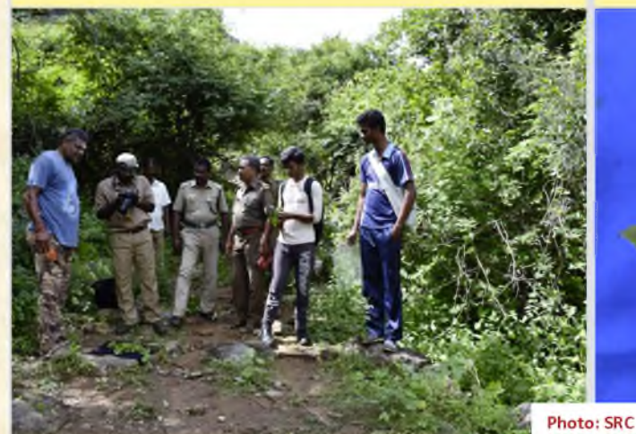
Research team at Velappar Kovil area, Megamalai Wildlife Sanctuary, Tamil Nadu