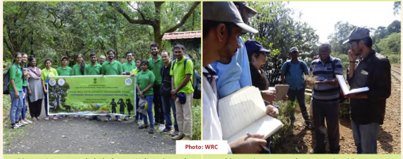
GSDP trainees at Mahabaleshwar Biodiversity park