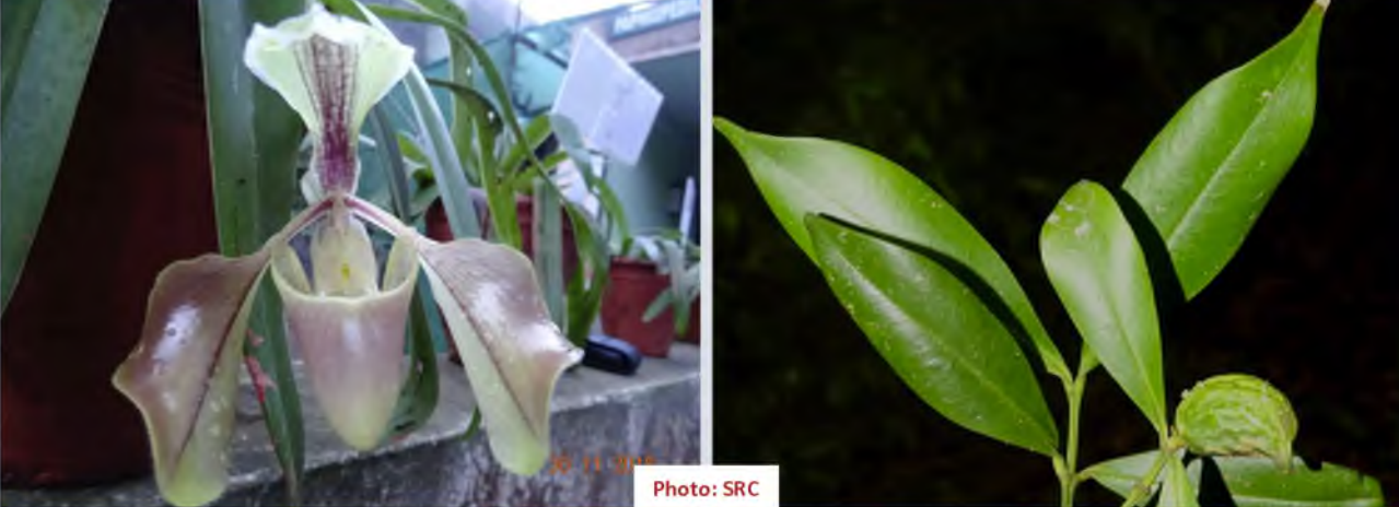
Paphiopedilum villosum (Orchidaceae)